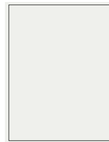
FULL PAGE including covers

All ad files must be submitted as a single page, high-resolution PDF/x-4