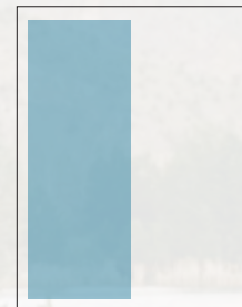
1/2 page vertical 4" w x 10.375" h

Artwork: 9.25" w x 11.125" h Live area: 8.25" w x 10.375" h