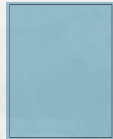
Full page (including covers)

Artwork: 9.25" w x 11.125" h Live area: 8.25" w x 10.375" h